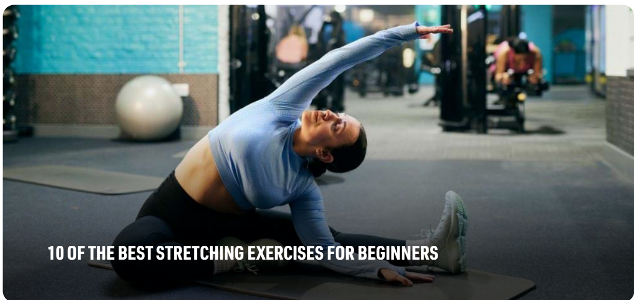
10 OF THE BEST STRETCHING EXERCISES FOR BEGINNERS